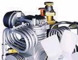
Corrosion resistant coolers