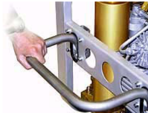
Ergonomic swing-out handles