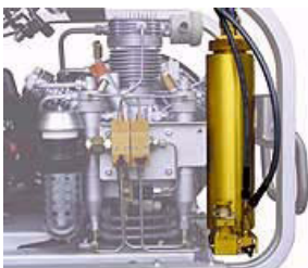
New P31 Super-Triplex filter system