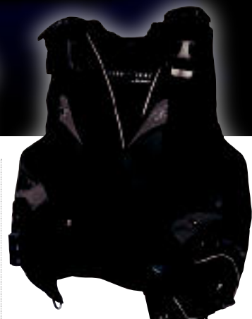
MOST DISTINCTIVE DESIGN

The back-buoyancy Aliikai MRS+ offers a slightly lower MSRP than many of the women's BCs we tested, but it's a full-featured, versatile model which works especially well for women who like their diving on the go. Its unique "Quick-Pak" system lets you fold it up to about half its normal size for packing. Plus it's plush, comfy and stable. Price: $600