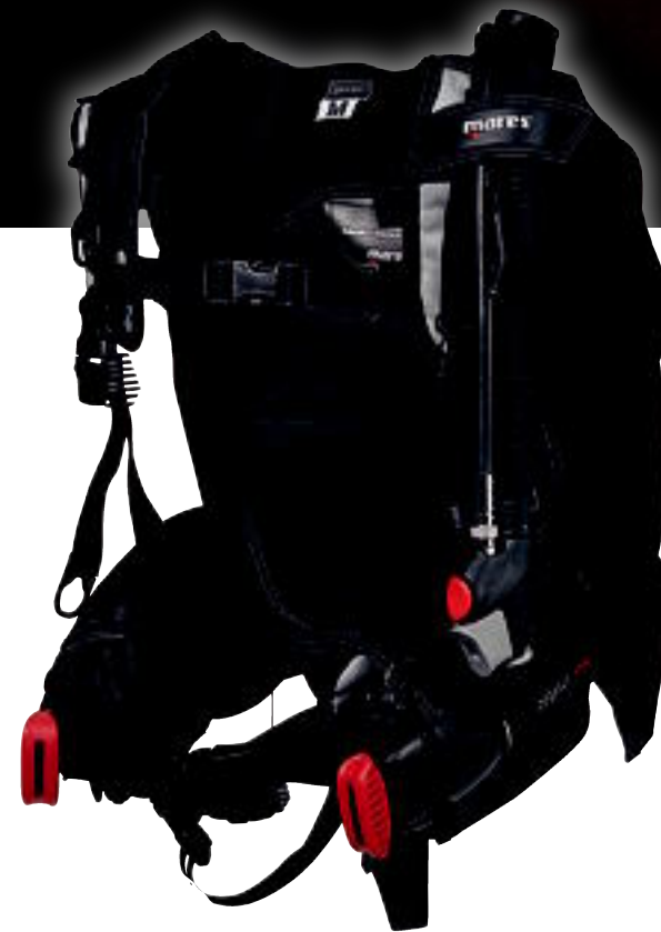
OUR TOP PICK FOR '08