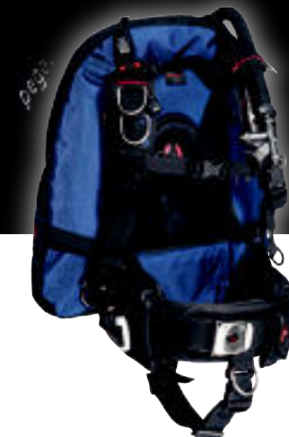
MOST DISTINCTIVE DESIGN

The Balance was introduced back in the 1990s and while it has been updated over the years, its basic design principle remains constant—a simple, back-buoyancy BC offering lots of lift and an uncluttered harness that maximizes comfort and stability at depth. It now comes with a Sure Lock weight-ditch system and a newly redesigned drop-down pocket, but it's still the Balance, and that's all right with us. Price: $570