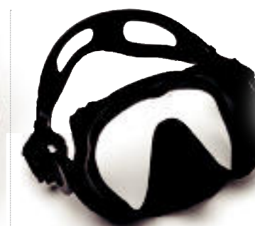
MOST BANG FOR THE BUCK

The Atomic Frameless earns our respect partly due to view, partly due to fit, but mostly because of the 100 percent commitment to get it right. Regular tempered glass wasn't good enough for the Atomic design team, so they went for an Ultra-Clear lens for better visibility and less distortion. One size didn't fit enough faces, so they came out with a medium-fit version. Finally, they figured dropping such a fine mask in a gear bag unprotected wasn't such a smart move, so they designed a low-profile case to match the low-profile shape of a packed mask. We can't wait to see what they'll come up with next. Price: $99