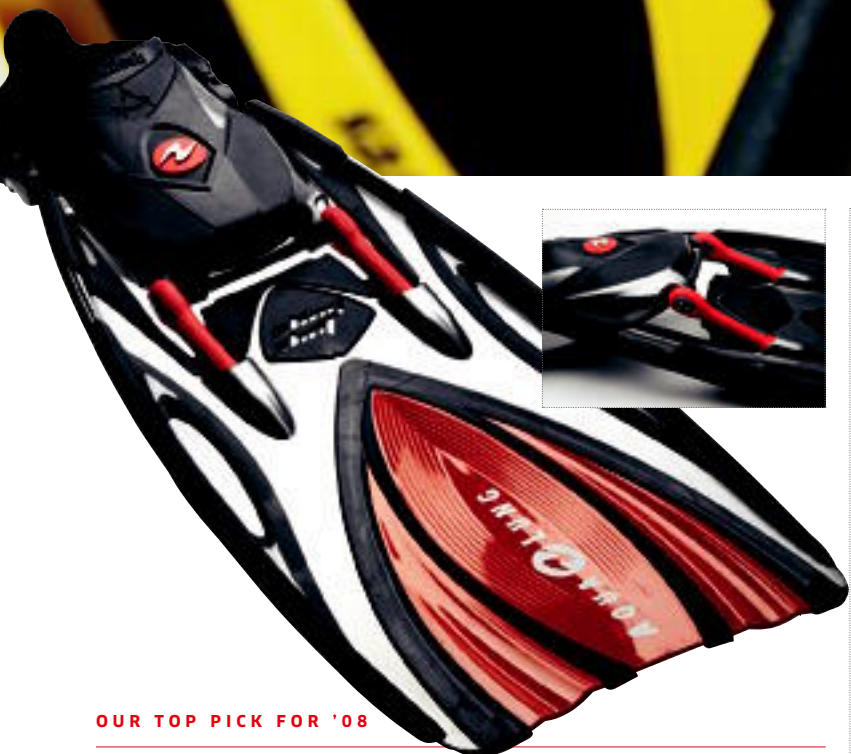
OUR TOP PICK FOR '08

While we didn't conduct a head-to-head review of new fins in 2008, each model we reviewed in the First Look column underwent a full battery of speed and maneuverability tests on the feet of the ScubaLab staff. Here are the models that impressed us.