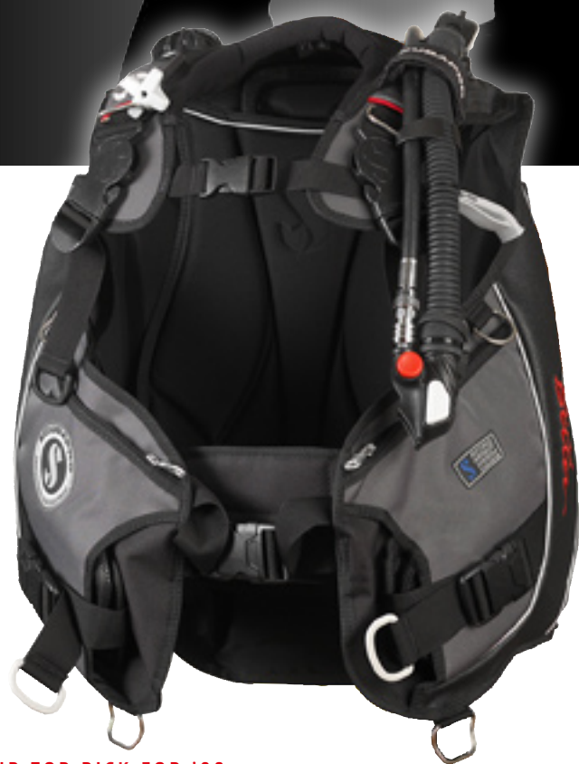
OUR TOP PICK FOR '08

In the August issue, we assembled a team of experienced female divers to evaluate 2008's crop of BCs designed specifically for women. No pushovers for foo-foo colors, these women picked the following BCs as their top choices, and we're not about to argue with them.