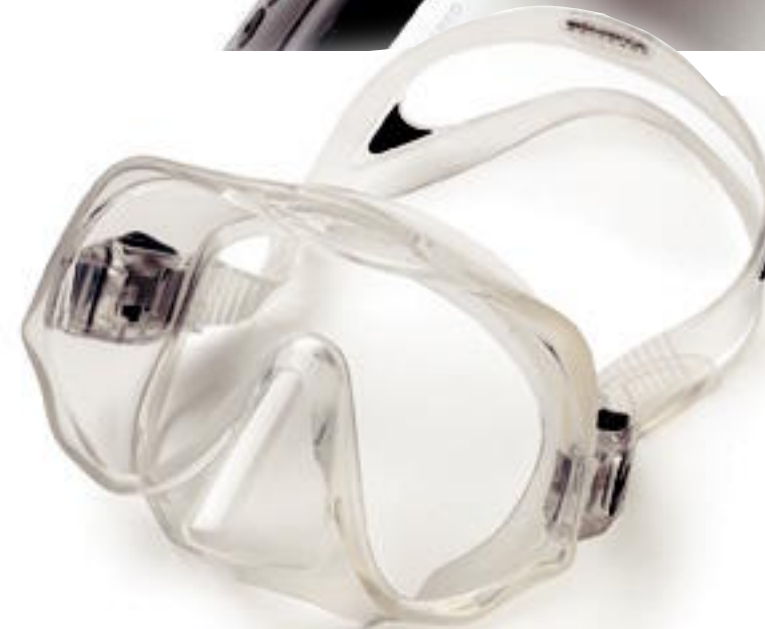
OUR TOP PICK FOR '08