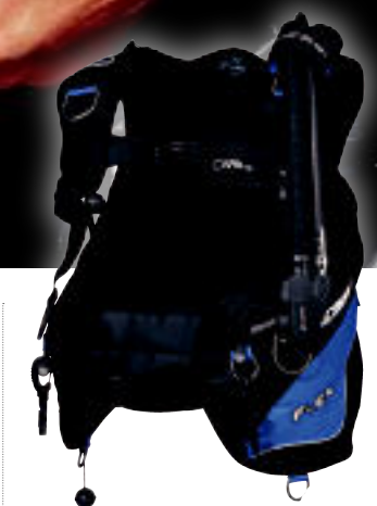
MOST BANG FOR THE BUCK

The low-profile Pegasus is so streamlined, so comfortable, and so free of chest clutter, you might think you're diving with no BC at all. But don't be fooled. This unassuming back-buoyancy travel BC actually has enough lift capacity (45 pounds) and ballast capacity (26 pounds) for temperate-water diving, which means you can use it on local dives as well as on vacation. It's loaded with cool features, including an ergo-designed power inflator, MRS+ mechanical-release weight system and a unique harness that includes parachute-style thigh straps (they're removable if they don't suit you). It all boils down to a lot of buoyancy control in a low-profile package. Price: $425