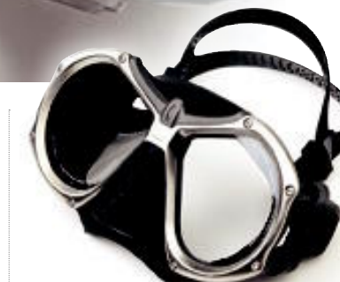
MOST DISTINCTIVE DESIGN

This classic still graces the faces of many hard-core divers. Its rectangular lenses and squared-off nose pocket give it a macho appeal befitting its 20 years of service. In spite of its age, it still provides a field of view comparable to newer designs, and an easy-adjust buckle system that's right up there with the best of them. Price: $115