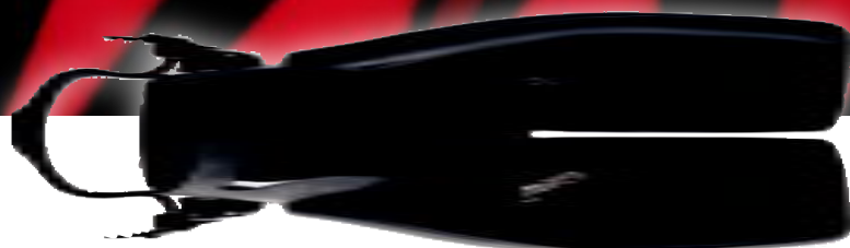
MOST BANG FOR THE BUCK

Yeah, we're double-dipping here, but design-wise, no fin came close to the innovation on display with the Slingshot. The entire construction concept is unique.