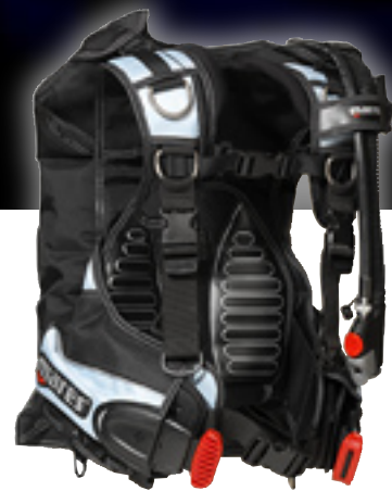
MOST BANG FOR THE BUCK